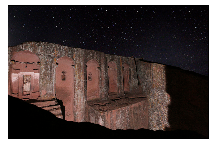
Church of Gabriel & Raphael, in Lalibela