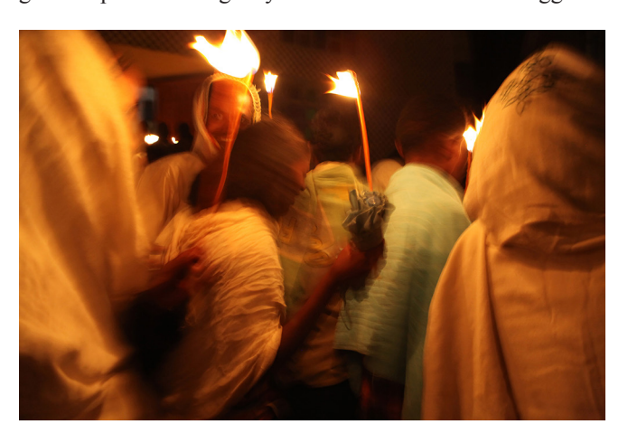
Procession of the Meskel Celebration, Aksum, Ethiopia

The relevance of the project is twofold. As much as it is an evidence-based correction to the historical record in regard to the origins of the Black diaspora, namely one that begins long before the transatlantic slave trade, it offers nuanced insights into gender equity, environmental and climatic awareness, and the interconnectedness and shared origins of spiritual thought systems around the world. Higgins