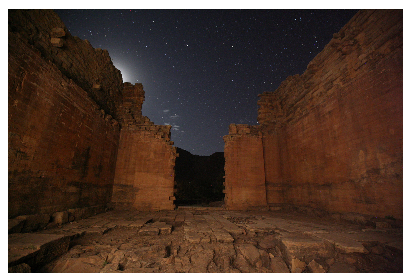
Moonrise at the Moon Temple of Yeha

starting point is "Lucy," when found in Ethiopia in 1974, the then-oldest fossilized human ancestor at 3.5 million years.