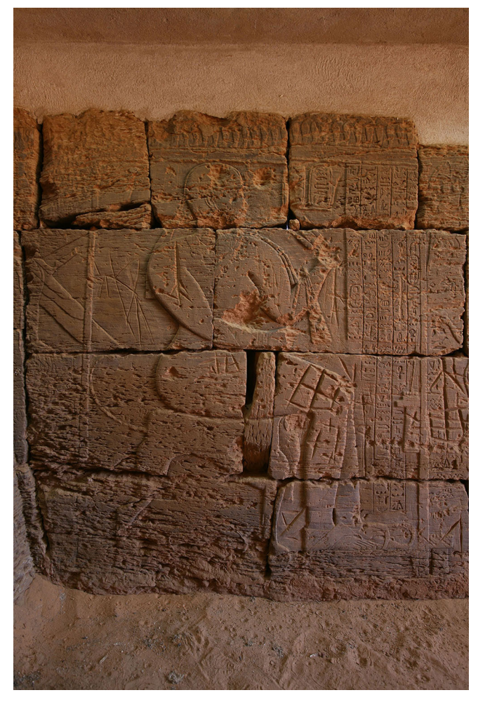
Nubian Kandake (Queen), Meroe, Sudan

The intersection of the divinity of women and the natural environment is traced back to prebiblical times in several photographs of artifacts and temples dedicated to women. To name a few: The Temple of Yeha in Ethiopia, also known as the Moon Temple and Temple of the Woman, dating back to circa 700 B.C.E.; The Temple of the Woman still in use by the Oromo people in the practice of Wakafana; female deities Isis, Hathor, and Nuit in Egypt; and, a depiction in stone of a Nubian queen holding three lotus flowers in her left hand and a whip in her right in Sudan. Referencing the Nubians, who had an equal number of queens and kings in their culture, Higgins notes, "You saw pictures of queens on the walls. What we really have from the ancients is ancient snapshots in stone. The snapshots in stone left by the Nubian queens were called Kandakes, which is a term for female ruler." He goes on to say, "We just wouldn't know about those female rulers if they had not left behind — in stone — snapshots of themselves."